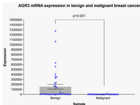
Fig. 1. AGR3 mRNA expression in benign and malignant breast tumors by qRT-PCR. The bar graph shows mean \pm standard error of the mean of n = 39 benign and n = 29 malignant samples. p = 0.001 by the Mann–Whitney U test.